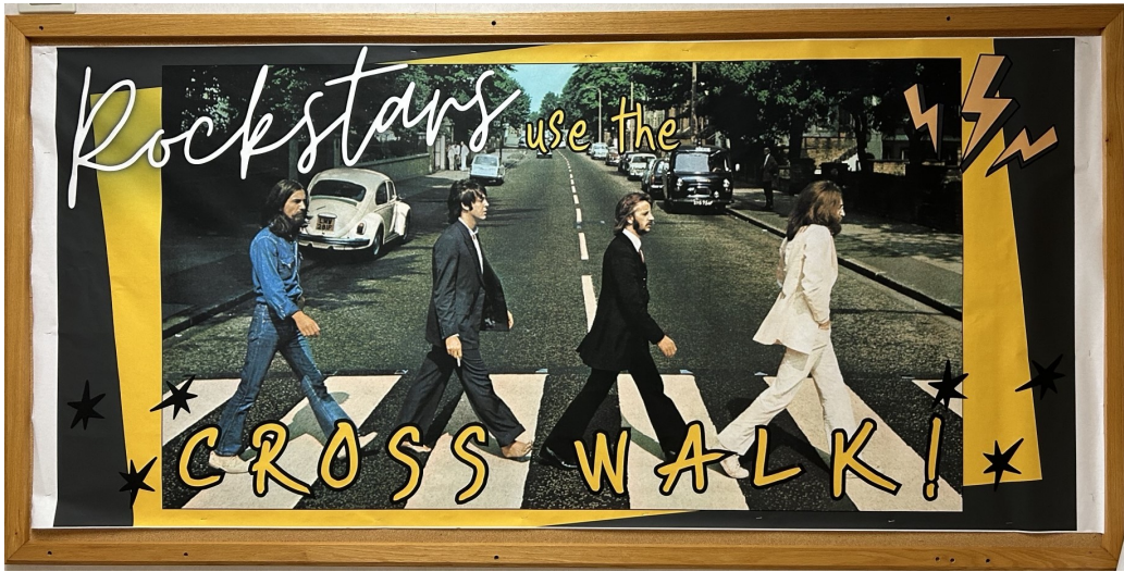
Large Bulletin Board: HHS Building, July 2024