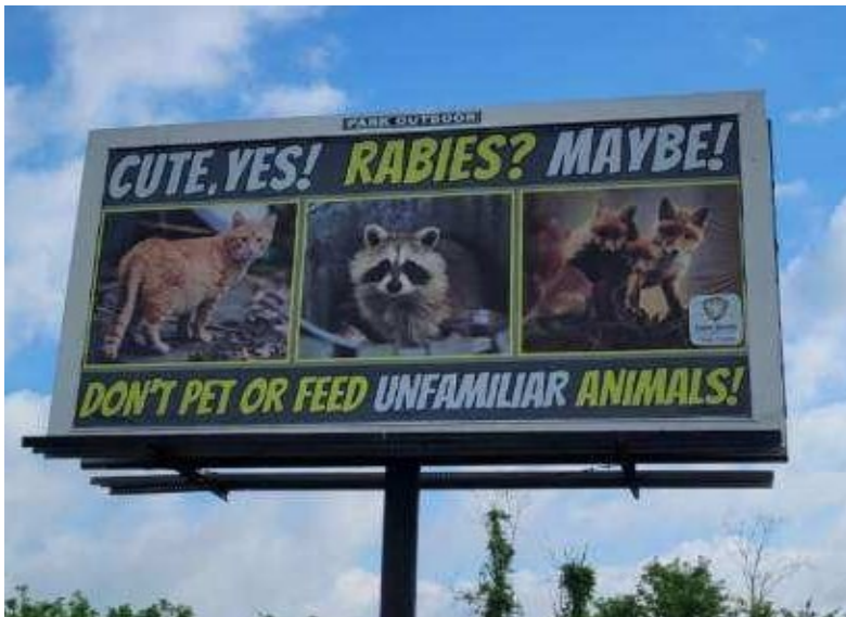
Billboards, Various Locations, July 2024