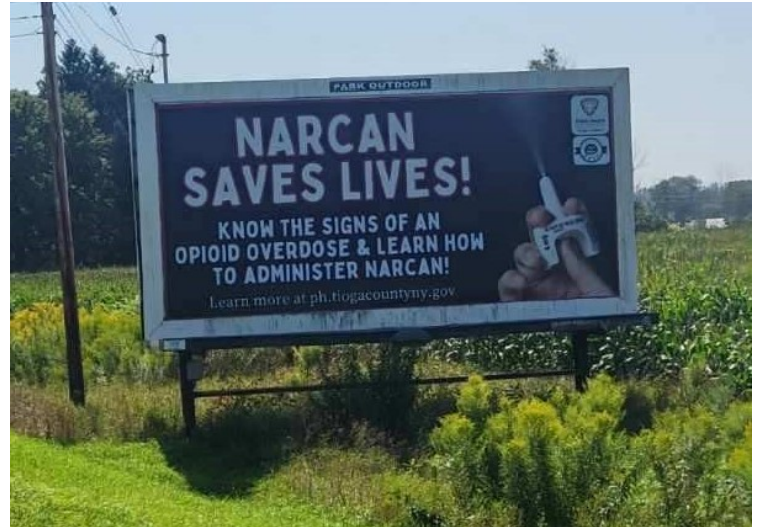
Billboard Design, Various locations, September 2024