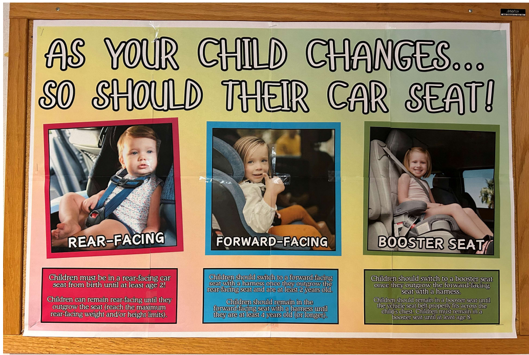
Bulletin Board: Health & Human Services Building, September 2024