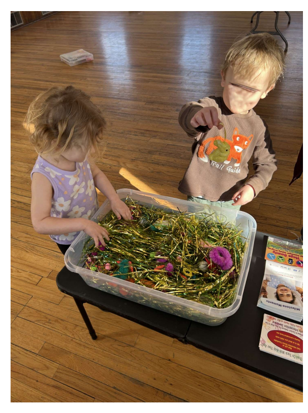
Example of Sensory Bins Brought to Spencer Family Resource Center by EISCs, March 2025.